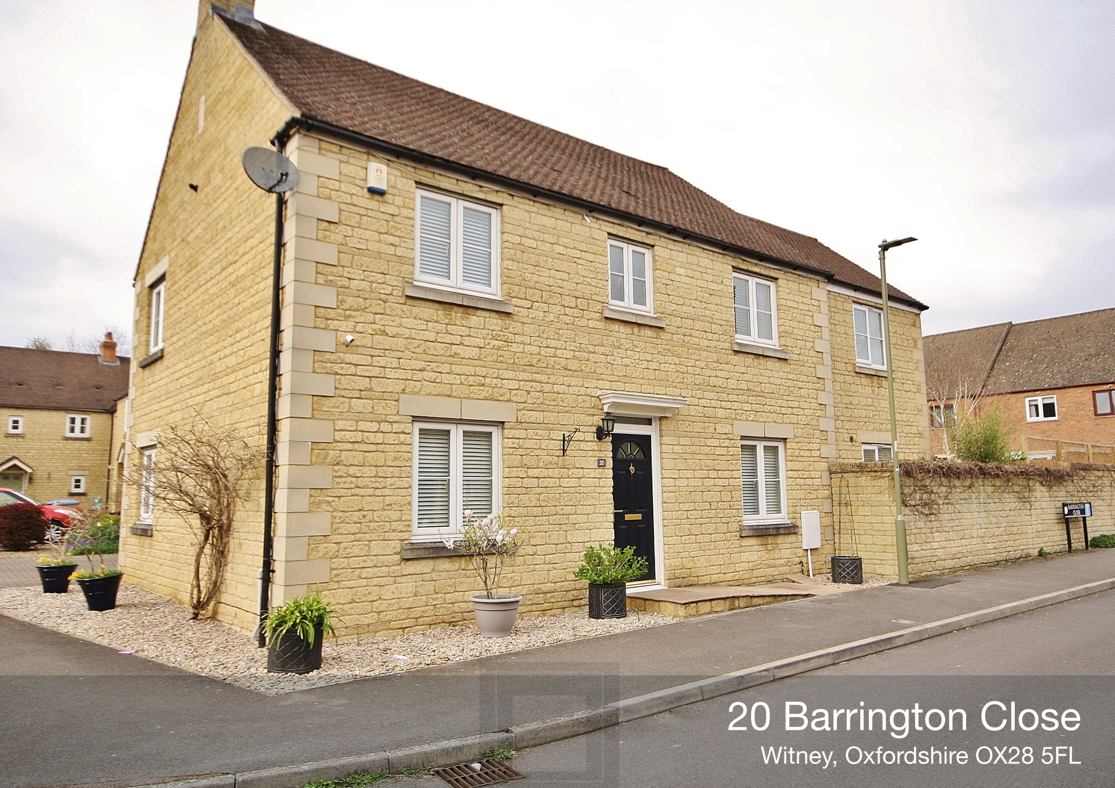
20 Barrington Close Witney, Oxfordshire OX28 5FL